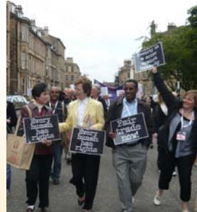
Mary Robinson leads the Human Rights march in Glasgow

Demonstrators marched through Glasgow to a rally in Kelvingrove Park on 21 st June to mark 60 years since the universal declaration of human rights , at a time when the political climate makes the issue as relevant as ever.