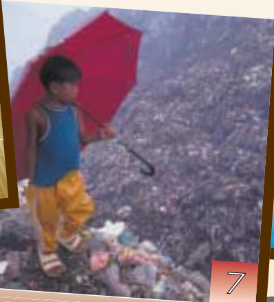
7 Clean up the environment