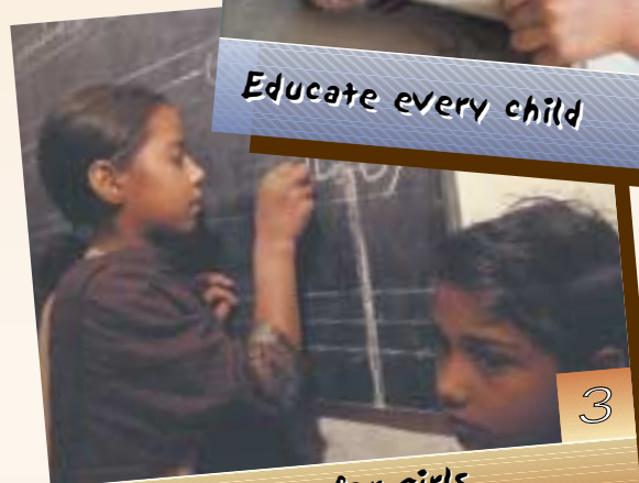
3 Equal chances for girls and women