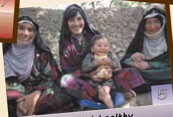
5 Ensure safe and healthy motherhood