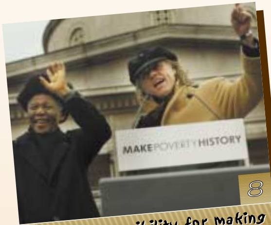
8 Share responsibility for making the world a better place