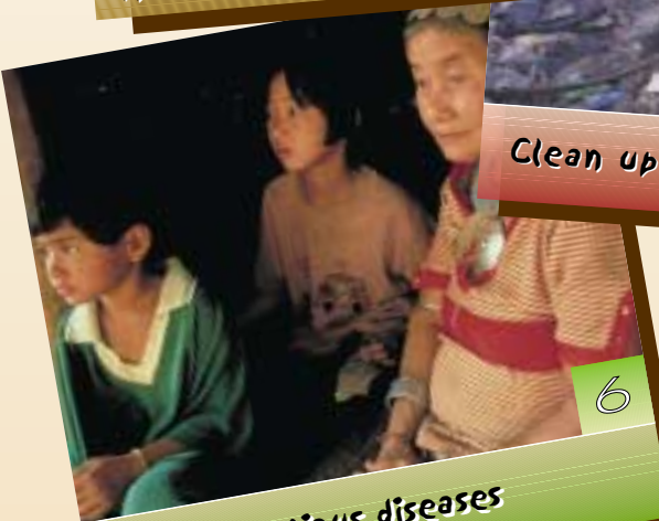
6 Fight infectious diseases