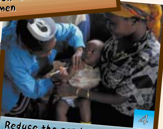
4 Reduce the number of babies and children who die