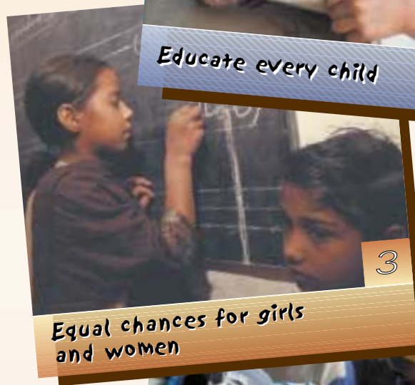
3 Equal chances for girls and women