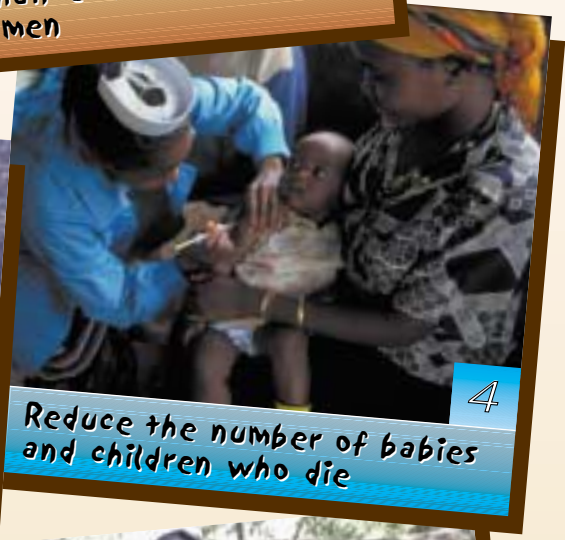
4 Reduce the number of babies and children who die