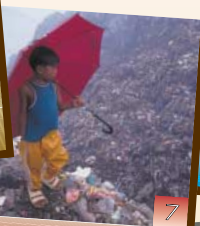
7 Clean up the environment