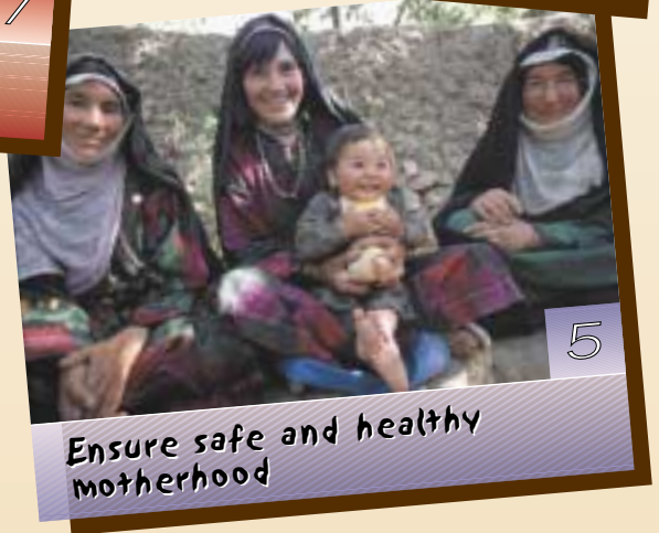
5 Ensure safe and healthy motherhood