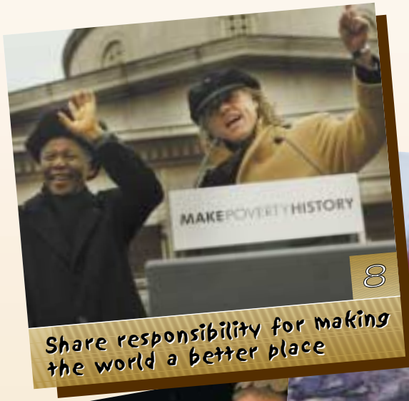
8 Share responsibility for making the world a better place