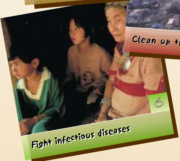
6 Fight infectious diseases