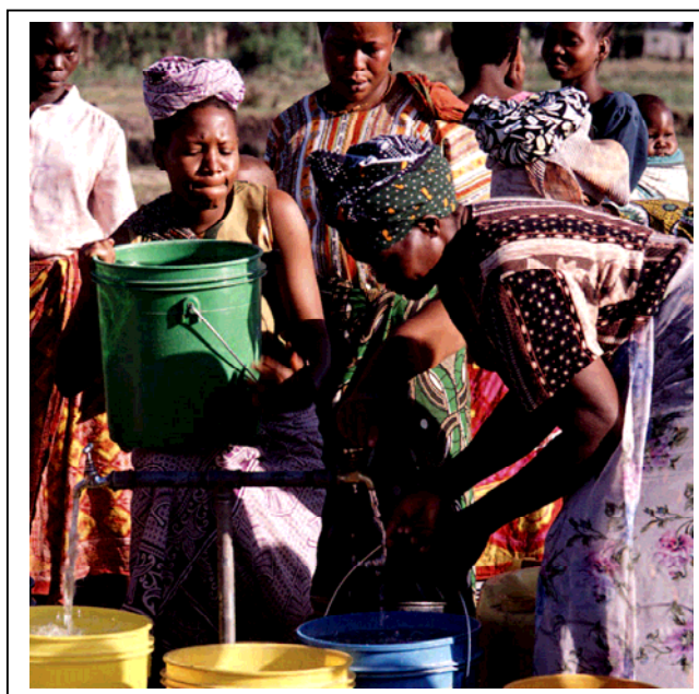
Householders collecting water from a tapstand in town of Shinyanga, Tanzania. The increase in the supply of clean water has reduced both the cost of water and the incidence of cholera and other water-borne diseases

Clean water and basic sanitation are vital to healthy living, yet this target is a very long way off being met. Indeed, some 1.6 billion people would need to gain better access to sanitation and safe drinking water between now and 2015 in order for it to be met: and on current progress the world is likely to miss the target by 600 million people. The drinking of dirty water and a lack of access to hygienic toilets are thought to cause 88 per cent of deaths of children under five from diarrhoeal diseases. In developing regions as a whole, access to better sanitation improved from 33 per cent of the population in 1990 to 50 per cent in 2004. As usual, however, some regions are doing better than others.