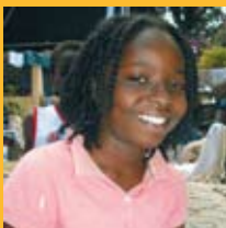
Haiti The long process of recovery

Working together to fight climate change and disasters.