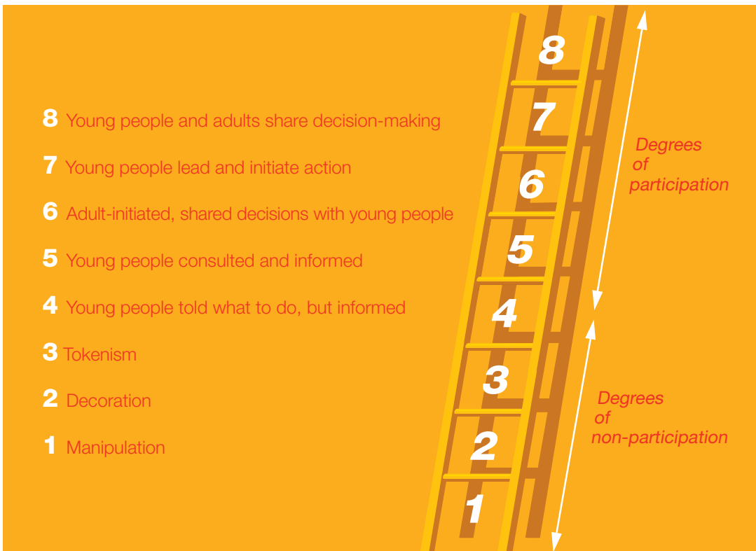
Adapted from Hart, R, 1992, Children's Participation from Tokenism to Citizenship , UNICEF

Download our free guide, Teaching Controversial Issues , for more guidance, classroom strategies and practical teaching activities www.oxfam.org.uk/education/teachersupport/cpd/controversial/