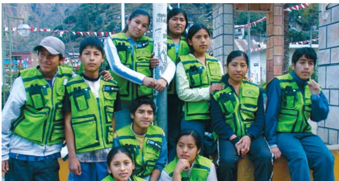
The Jovos (a Spanish acronym for ‘young volunteers for disaster prevention’) meet regularly to learn about the risks that the town of Sandia faces and how they can help people prepare.

Keep up-to-date on the latest Active Global Citizenship opportunities by visiting www.oxfam.org.uk/education and subscribing to our half-termly e-newsletter.