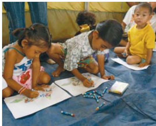
Clockwise, from top left: