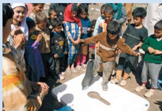
Right: Children learn to use latrines through songs and games in Al Resheed camp, Pakistan.

In emergency situations, we look at the threats to people's safety, as well as who is likely to be affected, and how. We support communities to make decisions and take action themselves, and take care not to undermine other ways they may already be dealing with these threats. We also work to influence governments, and international institutions, to provide protection to civilians affected by conflicts.