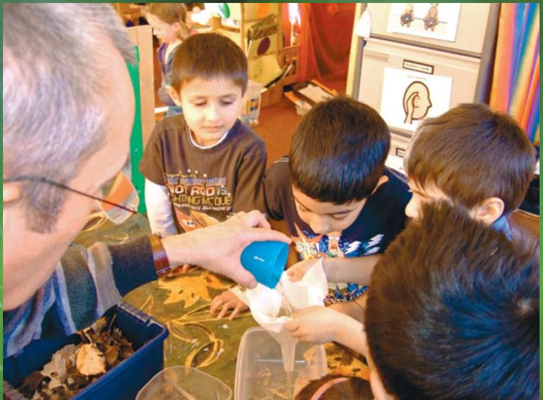
Year 3 pupils design and make means of collecting rainwater for a village in Pakistan

'I enjoyed watching all the rap performances. Global Water Day was absolutely terrific!' Aneeka