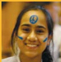
Peer leaders Taking action on climate change