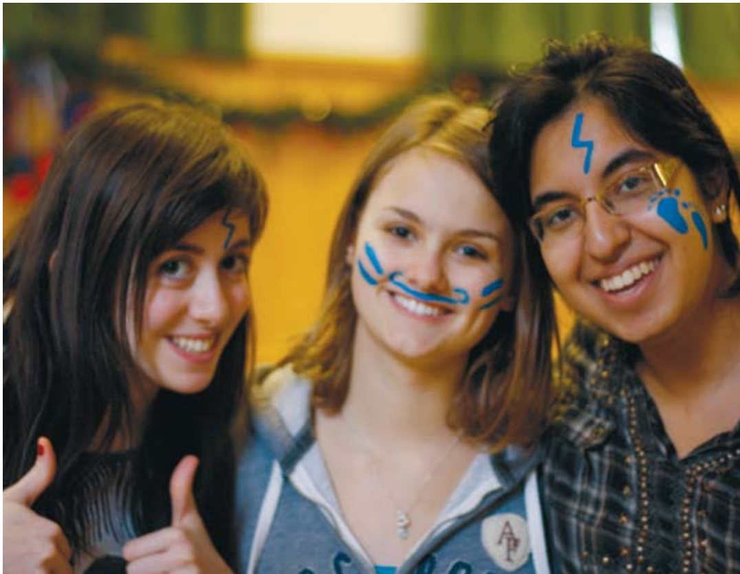
Left page: Students from Fairfield High School collect over 100 signatures which appear on a 50ft petition; while local band Twenty Twenty play a mini Oxfam.