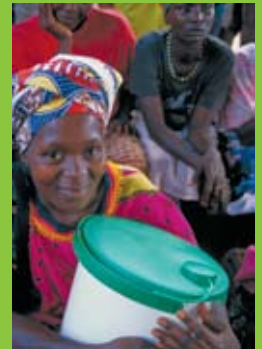
Nyawama Camp in Sierra Leone. Here, newly-qualified camp hygiene promoters are given their hygiene kit – bucket, soap, brushes and jug – after attending a two-day Oxfam course.

Built-in cap, which never gets lost and helps to keep water safe and clean