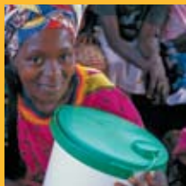
Bucket loads! The power of the plastic wonder