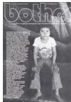
Bother magazine for young people, focusing on the Civil War in El Salvador, March 1982

The 1974 Race Relations Act recognised that racism undermines a stable society and thus Multicultural Education was born, challenging stereotypes.