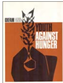
Freedom from Hunger Campaign, 1965