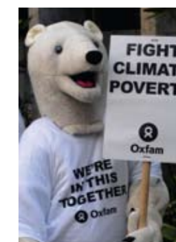
Oxfam campaigners at the UN climate conference, in Bali, December 2007.