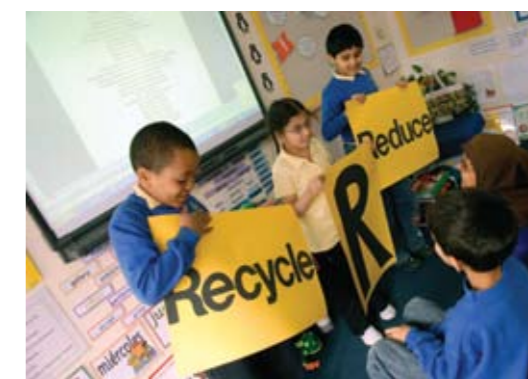
Left: A young campaigner writes to his MP about climate change. Right: Pupils rehearsing for an assembly, themed around climate change, at Jubilee Primary School, Hackney.

We know that young people in the UK already care deeply about climate change, and this is our chance to help them tell world leaders they must act this December.