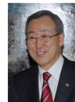
Ban Ki-moon, Secretary-General of the United Nations

For more activities, ideas and support for taking action on climate change visit www.oxfam.org.uk/education