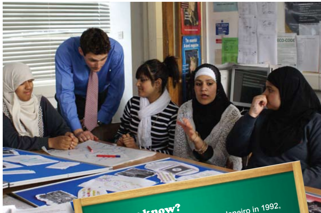
Students at Oxford School discuss how climate change is impacting on the MDGs with their teacher.

Our school is campaigning alongside Oxfam for change at the December 2009 Copenhagen Summit. For me, the day brought home why I am a teacher. The students began knowing relatively little about the issues involved, but you could see the light bulbs go on as they realised they can make a difference.