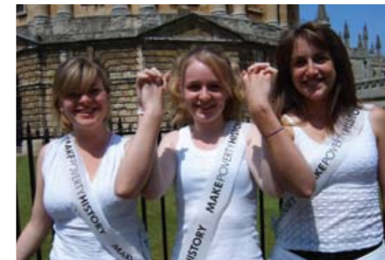
Young campaigners create a human chain around the Radcliffe Camera, Oxford in a call to Make Poverty History.

Our regional campaigners are available to work with local schools and youth groups. They deliver a range of exciting and challenging projects that inspire young people to become active global citizens, and provide training, advice and support. Get in touch to find out more!