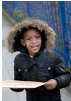
A young campaigner on her way to post a letter to her MP Diane Abbott.