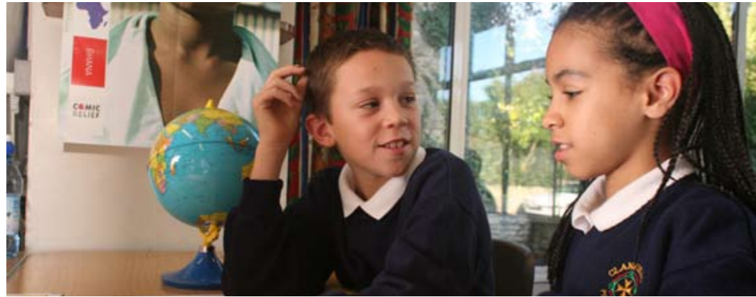
Pupils share ideas during a Global Citizenship lesson at Clanfield Primary, near Oxford.

For more professional development resources from Oxfam, visit www.oxfam.org.uk/education