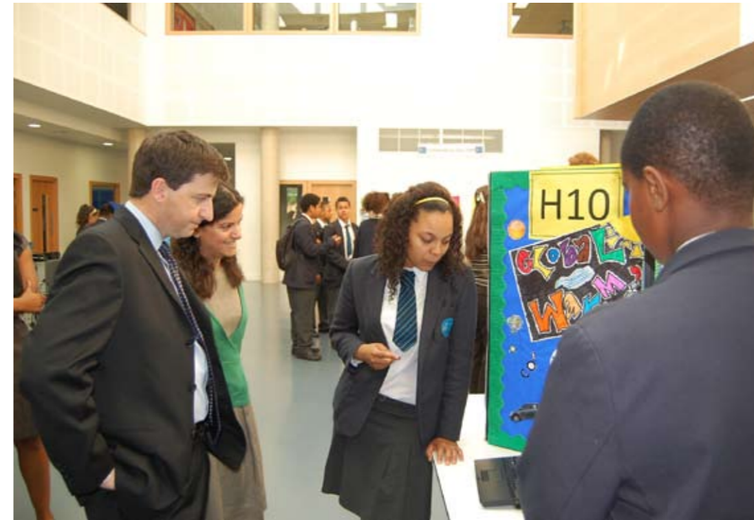
Douglas Alexander, Secretary of State for International Development, with staff and pupils at St Mary Magdalene Academy.