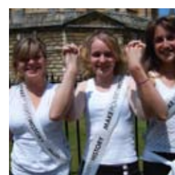
Active Global Citizens Page 11