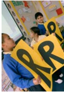
Pupils rehearsing for an assembly about climate change.