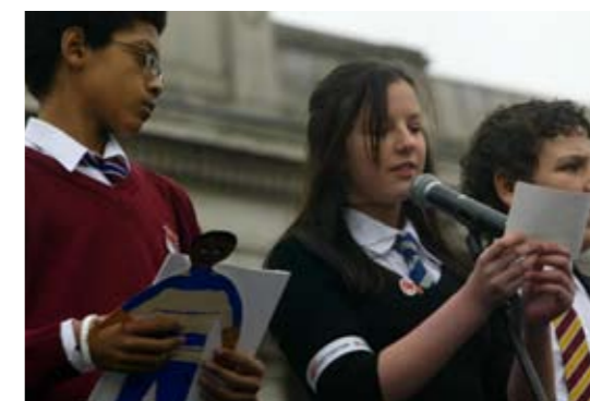
Children from Langdon School, East Ham, London speaking in Trafalgar Square during the launch of the Make Poverty History campaign.