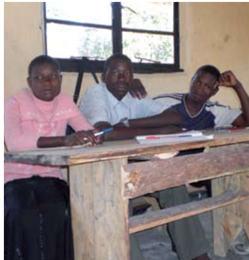
Three pupils sharing a desk for two makes learning more difficult.

In the Copperbelt Province of Zambia, many children have lost one or both parents to HIV and AIDS, leaving them with the responsibility of caring for younger siblings and with little money for school uniforms or books. Oxfam is working with communities and local authorities to achieve a high-quality education for all, giving future generations the chance to lift their communities out of poverty.