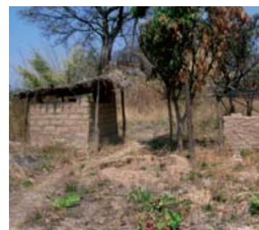
The only toilet at Kopolo Community school. This project will improve sanitation facilities.