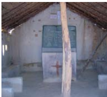
Most of the community schools use churches for classrooms. This project will improve school infrastructure.

The Copperbelt Province has one of the highest population densities in the country. In one district alone, there are 90,660 orphaned children who have