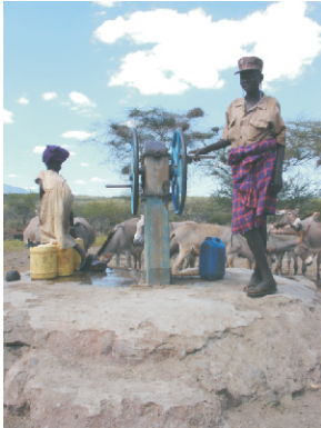
A Turkana herder in northern Kenya at a water-well provided by Oxfam. Better access to water sources means that pastoralists' vulnerabilities are greatly reduced.

D rought and other hazards like floods are a major threat to livelihoods and development in the arid and semi-arid areas of the Horn and East Africa.