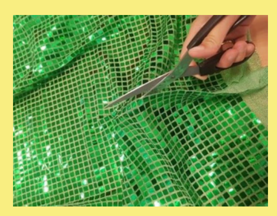
Step 1: Select and cut some pieces of fabric from unwanted clothes. You'll use these to make your bunting flags.