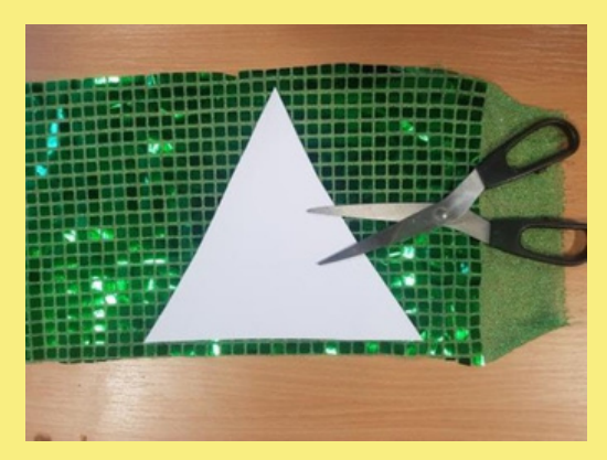
Step 2: Cut a triangle from a piece of card. This is the template for your bunting and will help you to make sure all pieces are the same size. Place the template on top of your fabric and cut around it to create flags for your bunting. The more flags you cut, the longer your bunting will be.