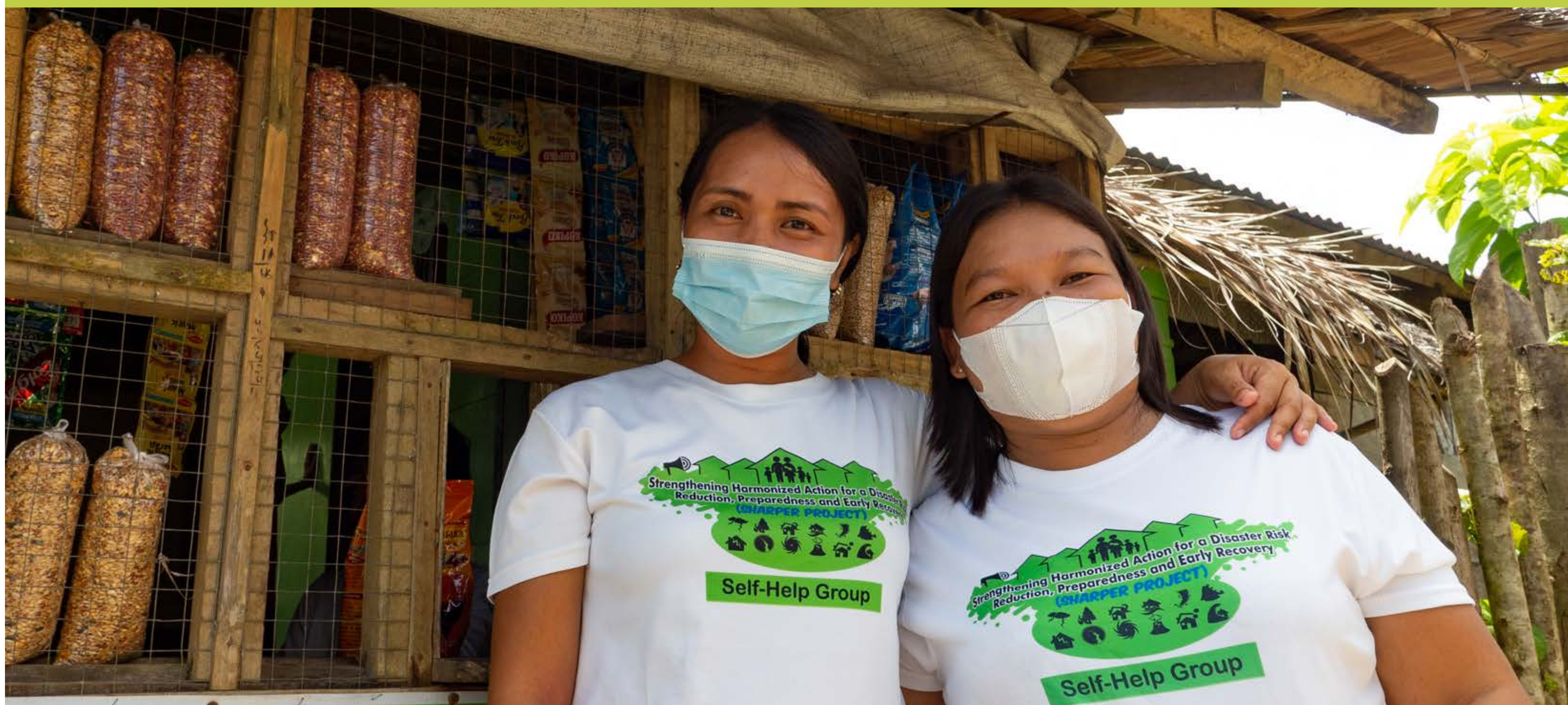
Women from two self-help groups in San Isidro have opened small shops with their pooled savings.

Oxfam's climate-related work has evolved – moving from agricultural support to community action and challenging climate policies and financing to achieve change.