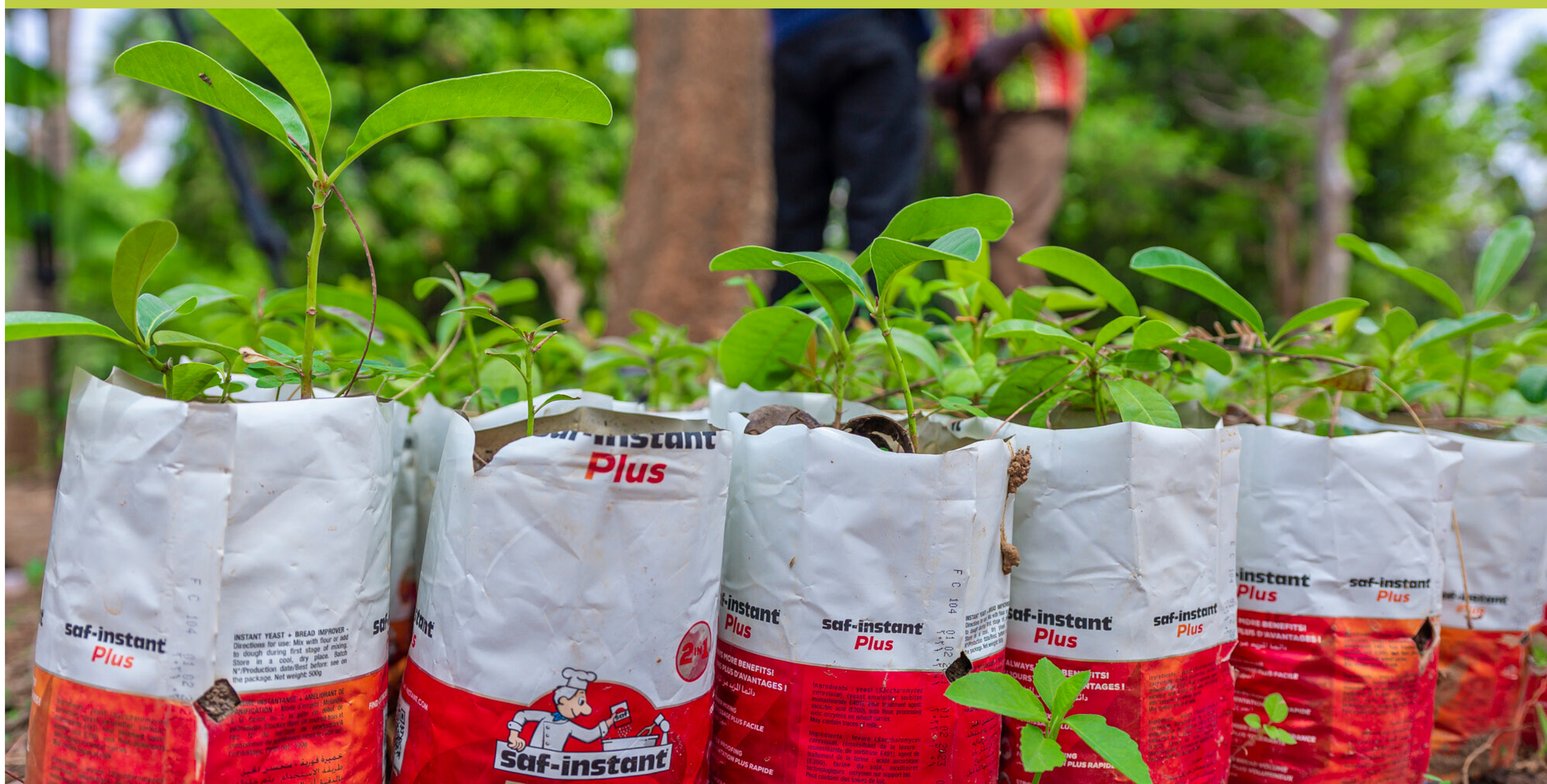
In Koutiala, San and Tominian, (Mali) the Regreening Africa project is working to reverse land degradation by encouraging smallholders to grow trees on their farms and revive existing ones.

of projects led to people being better able to cope with climate shocks and stresses.