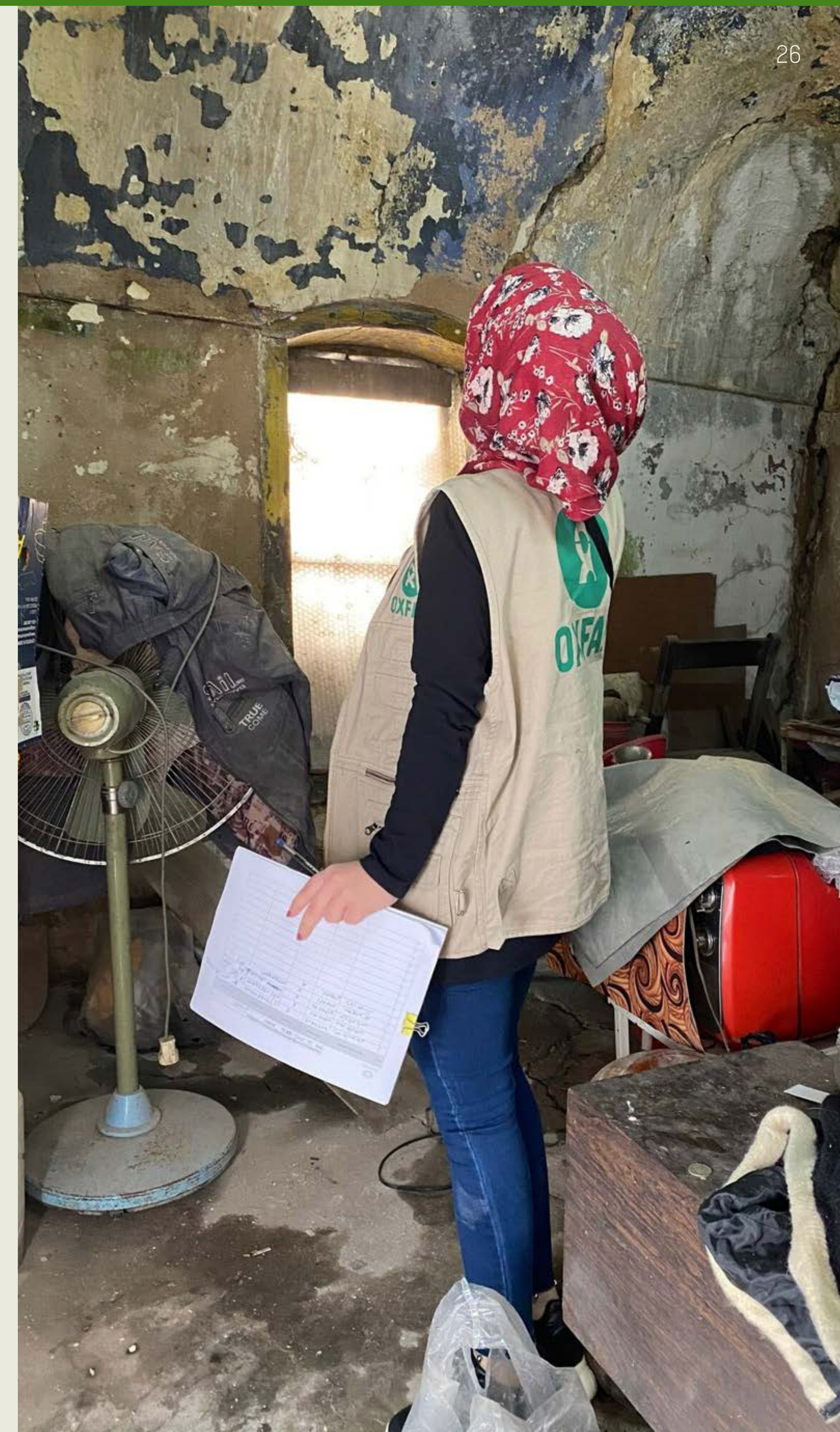
Oxfam Emergency Response to Mosul Flooding.